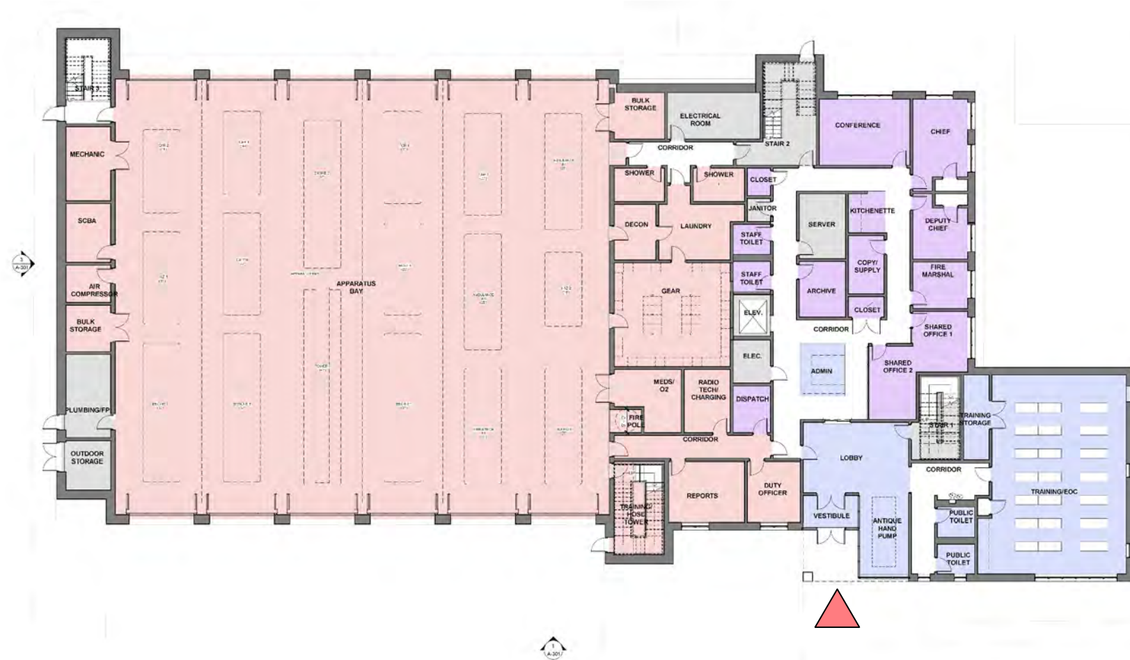
PLAN LEVEL 1 1/8" = 1'-0"