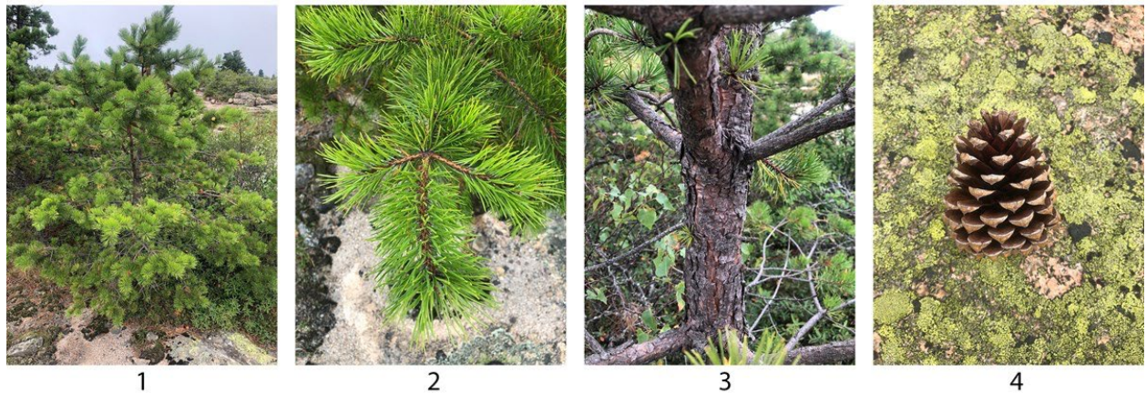
Pitch Pine

This white pine forest claimed abandoned fields starting in the late 1800's. The stone-free soils that formed on lake-bottom sediments support a dense stand of 100-foot-tall trees. Drought-tolerant pitch pines also are present and were early seedlings after farming ceased on these sandy soils. They are gradually being shaded out by the taller white pines.