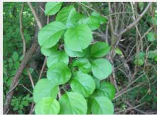
Oriental bittersweet foliage

Several types of vegetation not native to New England have invaded this area. The English Ivy has engulfed the full height of some trees and threatens to shade them out. The ivy is not considered invasive in New England but several other plants in this patch are classified as invasive. These include bittersweet vine, burning bush, Japanese barberry, and Norway maple. Disposed yard wastes may have been the source of these plants. Fortunately, invasive plants are largely absent throughout most of Edmund Woods. Note that the ivy has been trimmed by deer to a height of about 5-6 feet on tree trunks.